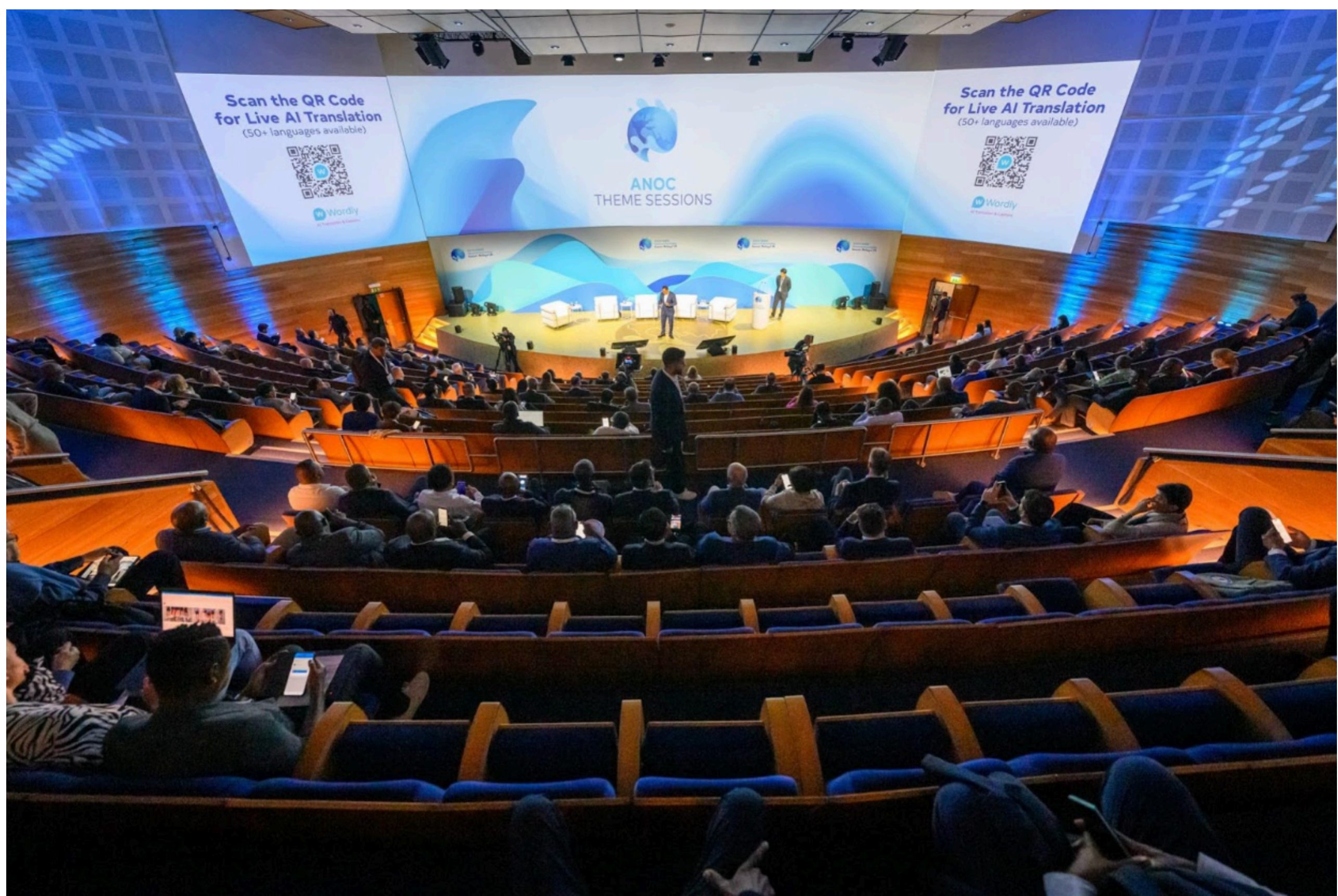
Attendees access translation by scanning the Wordly QR code

One standout Wordly feature used at the event was the customizable glossary, which allowed the team to add unique terms such as acronyms and presenter names. This customization ensured smoother and more accurate translations. For this event, 200+ terms were added to the glossary.