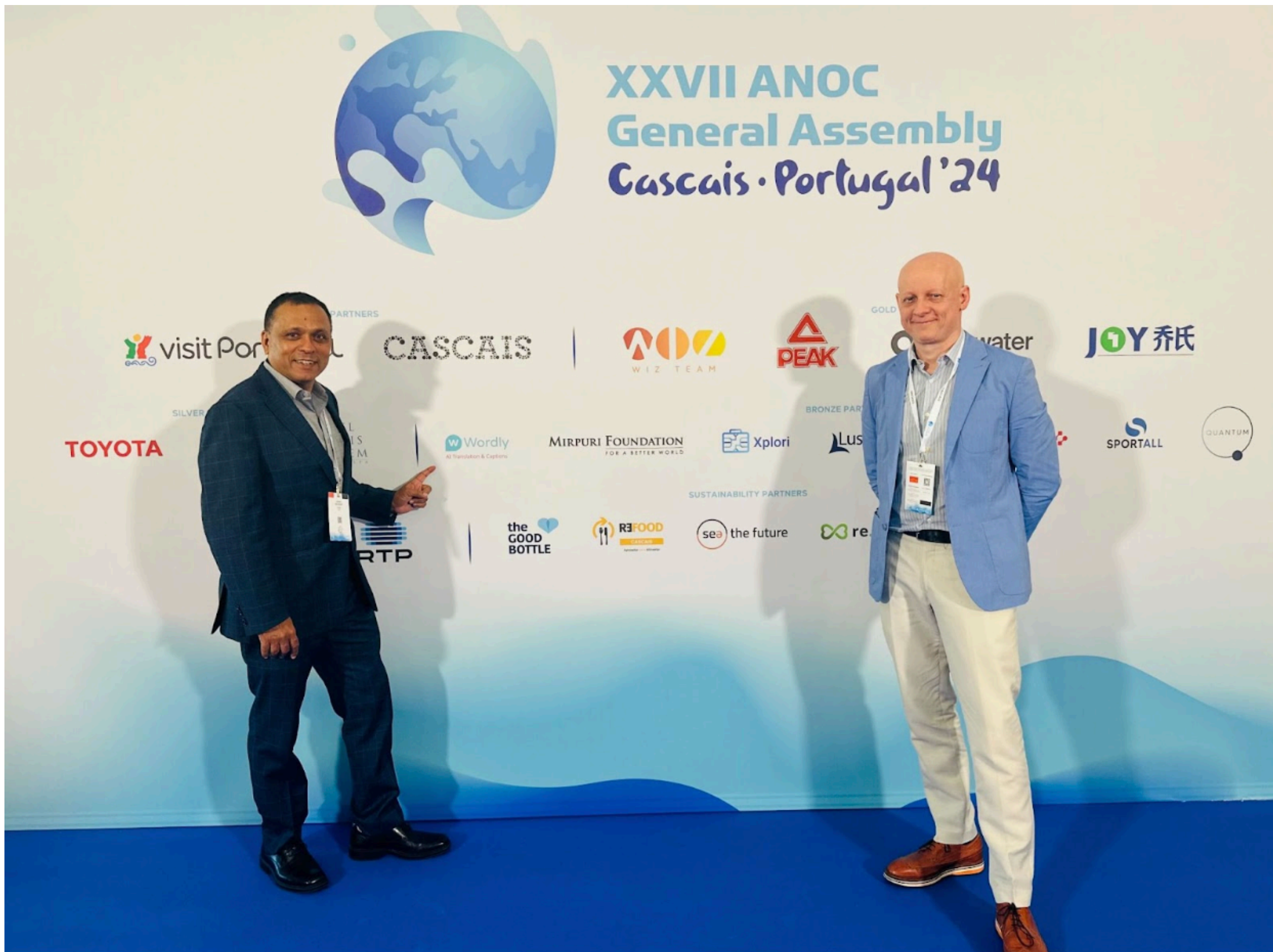
Wordly helps international sporting association increase event engagement and comprehension