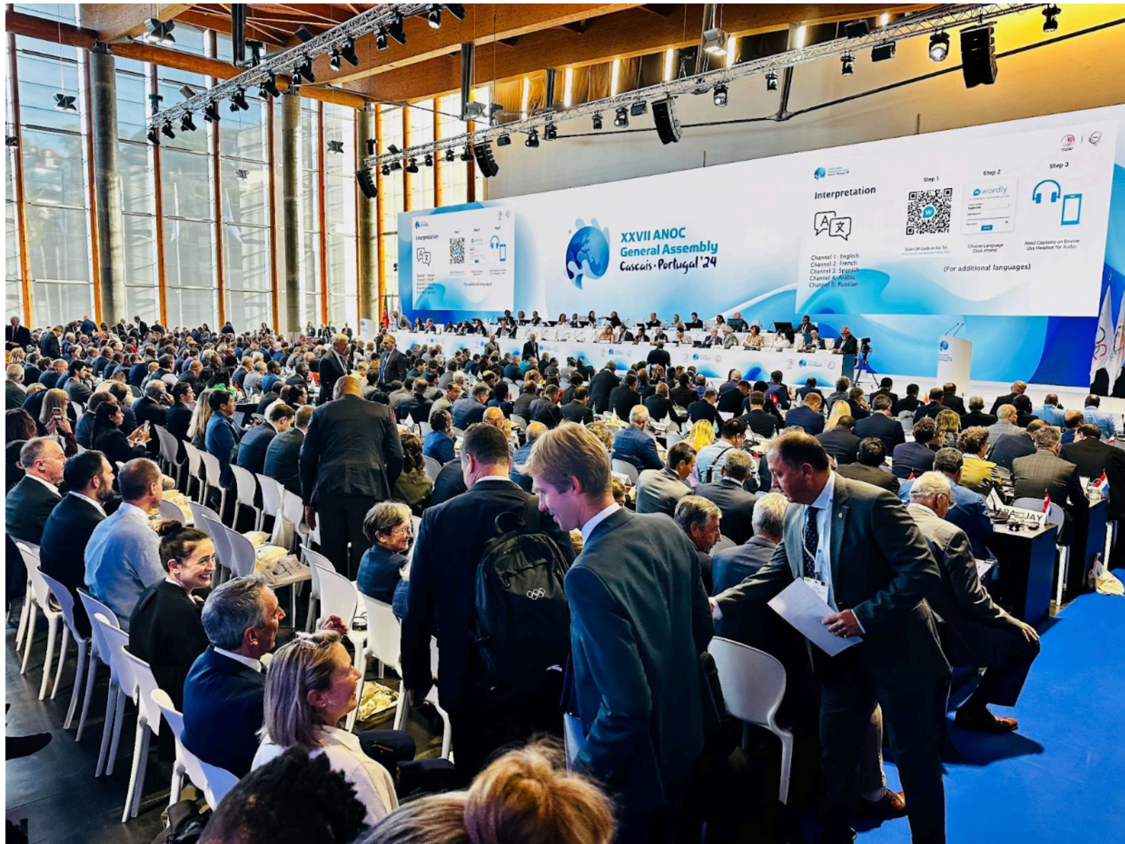
Wordly deployed at an international sporting association conference

An international organization that hosts the largest annual global Olympic Movement gathering successfully integrated Wordly's live AI translation services at their recent 5-day event. This prestigious event brought together 850+ attendees from 195 countries, offering a platform to shape the future of sports and honor excellence in the Olympic Movement.