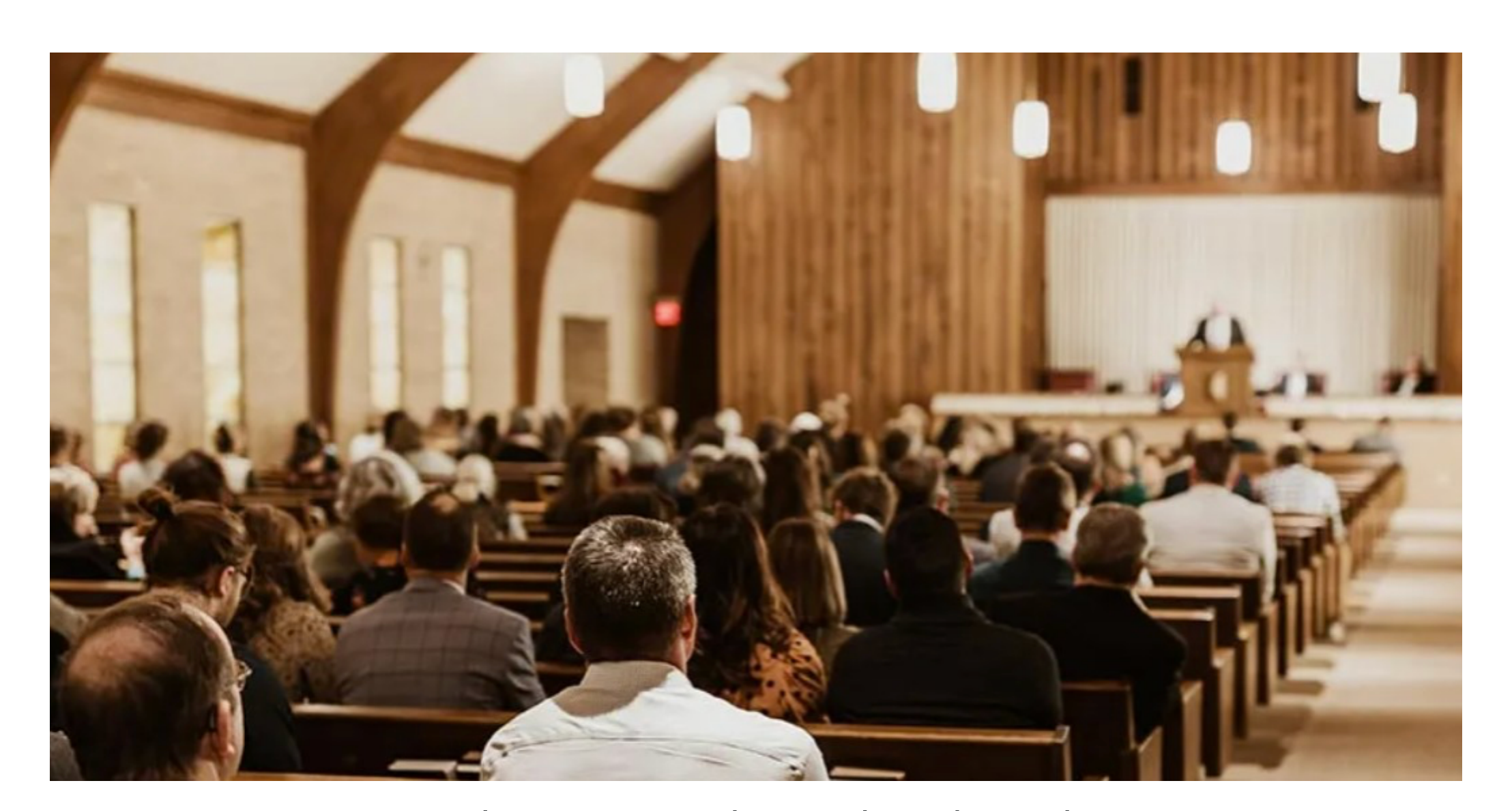
Parishioners United in Faith and Worship.

"We wanted this day to be as special as possible for the couple, and Wordly made that possible in a way we never imagined. To see their family in Haiti, hearing every word, every prayer, every vow in real time—it was truly powerful. It wasn't just a wedding; it was a celebration of love, faith, and unity across any distance. This is what church is all about: bringing people together, no matter where they are."