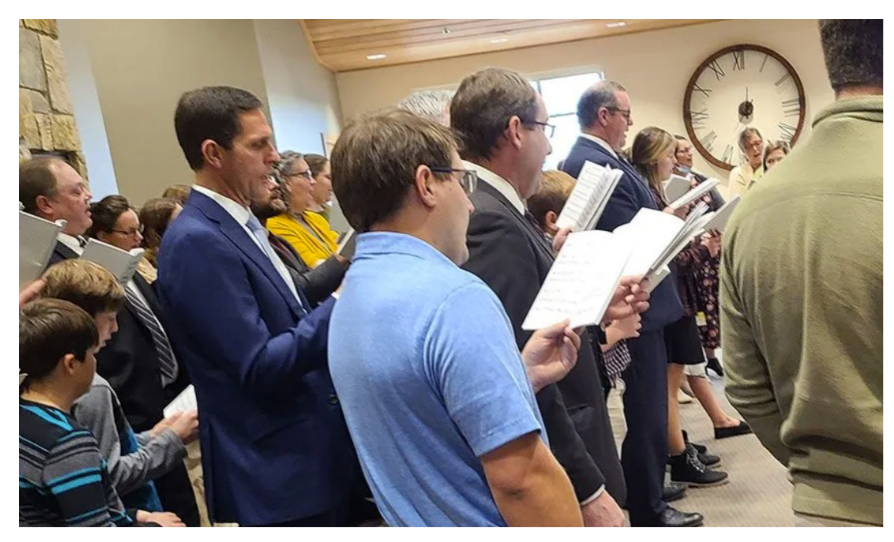
Parishioners United in Faith and Worship.

"Our mission is to ensure that everyone, regardless of the language they speak, feels at home in our church. By breaking down language barriers, we are opening the doors for all to hear the Word of the Lord, participate fully in worship, and find a true sense of belonging in our faith community."