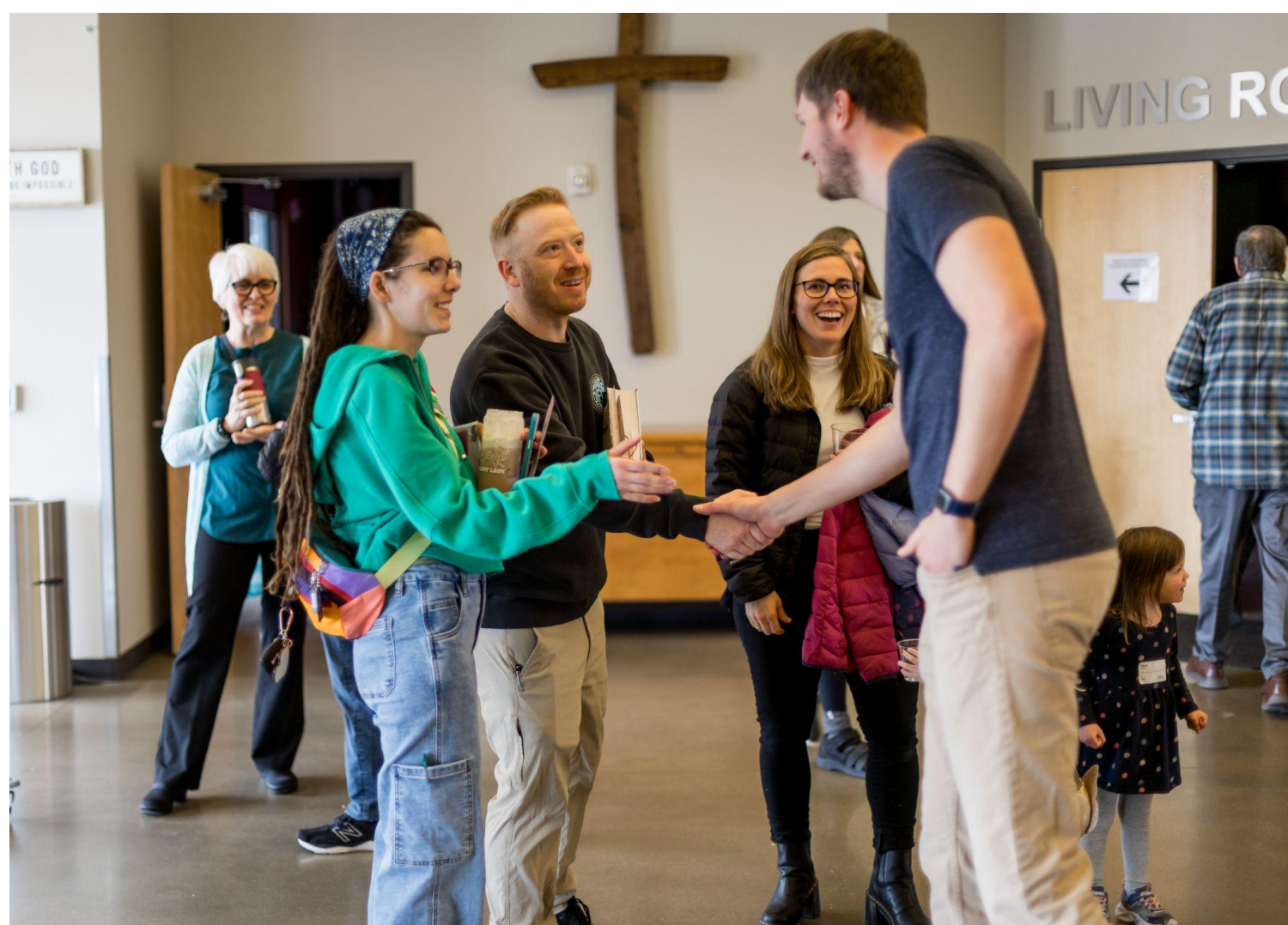
Timberline Church: Connecting Through Warmth and Fellowship

This exercise opened new conversations, new connections, and a broader sense of community, one where we strive to understand each other's experiences, rather than just observe them from a distance.